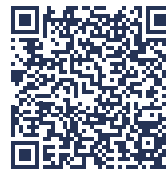
Weighting tables and certification criteria (DGNB GmbH)

All required documents are available digitally from DGNB GmbH ( www.dgnb.de/en/certification/specific-applications-of-the-dgnb-system/dgnb-special-award-ecolabel ) and HafenCity Hamburg GmbH ( hafencity.com/en/dgnb-certification ) or can be requested there.