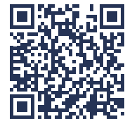
Further information (HafenCity Hamburg GmbH)